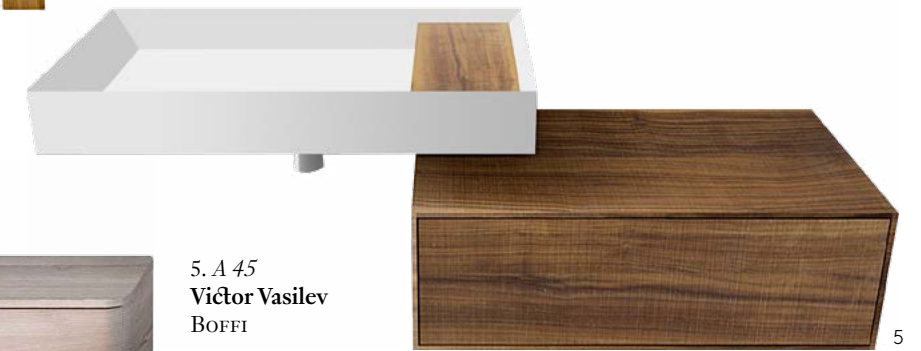
5. A 45 Victor Vasilev BOFFI