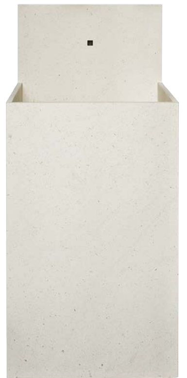
5. Lavandera Mario Mazzer MINOTTICUCINE