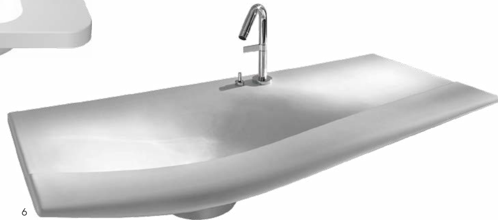
6. Stillness JACOB DELAFON