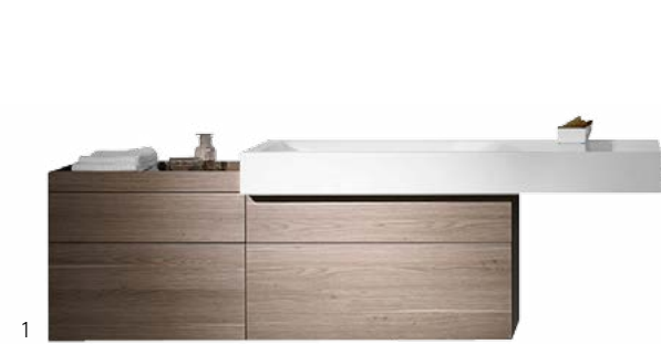
1. Addict ALAPE CHEZ B'BATH