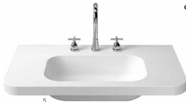
5. Novecento XL Benedini Associati AGAPE