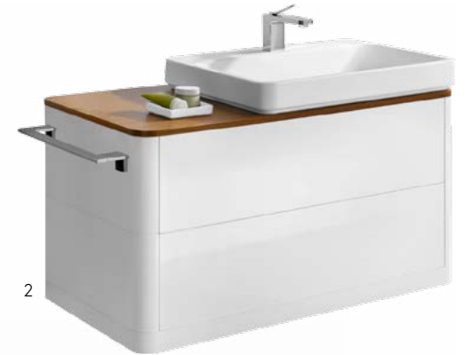
2. Square Geometry Elium Studio TOTO